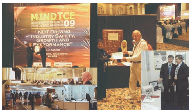
MINDTCE 09 - a huge success

Czech Republic, Australia, Belgium, Iran, Singapore, Canada, Lebanon, Italy, Germany and Japan. 19 exhibitors took part in the associated exhibition.