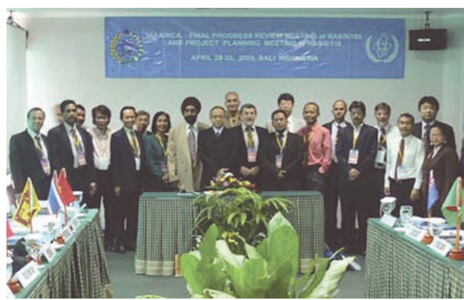
19 participants from 15 member states attended the meeting

radiographic techniques, such as low throughput, increased radiation exposures and associated difficulties in maintaining archives of high volumes of exposed films. DR provides a long felt suitable alternative providing excellent image and archival qualities and manageability of huge data. CT provides image details, such as defectsizing, location, two-dimensional (2D) and three-dimensional (3D) imaging, which are vital but not provided by conventional radiography techniques. Some of the advanced countries have