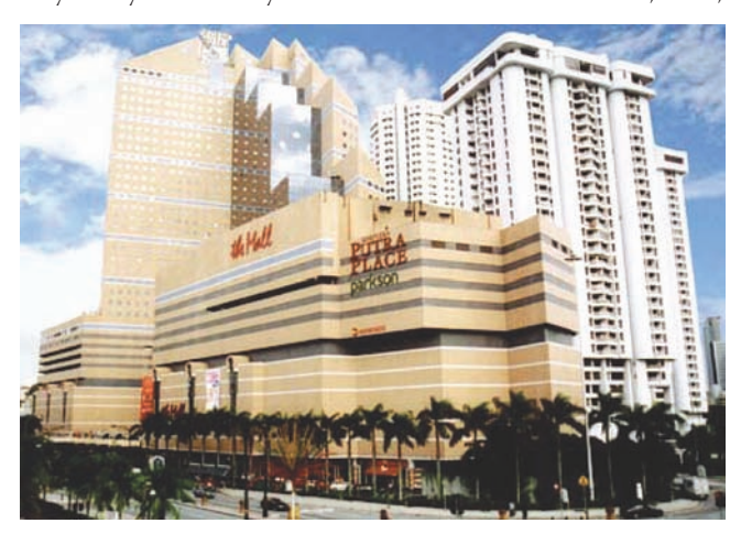
The Legend Hotel in Kuala Lumpur

The conference attracted more than 200 participants from not only Malaysia but many overseas countries such as the UK, India,